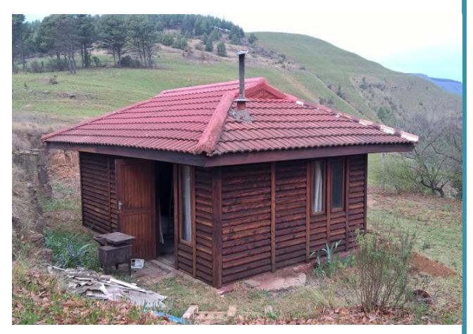
The Replica in the Natal Highlands

To find out more about this interesting project being undertaken by Ludwig ZS6WLC, type or copy the following link to his website: