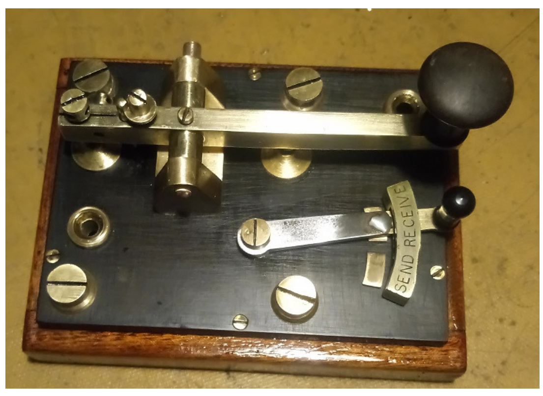
1915 GPO 562

They grow to know each other's habits moods, and foibles, their likes and dislikes and when there is a break in the circle through the death of a member, his absence is felt just as in personal association.