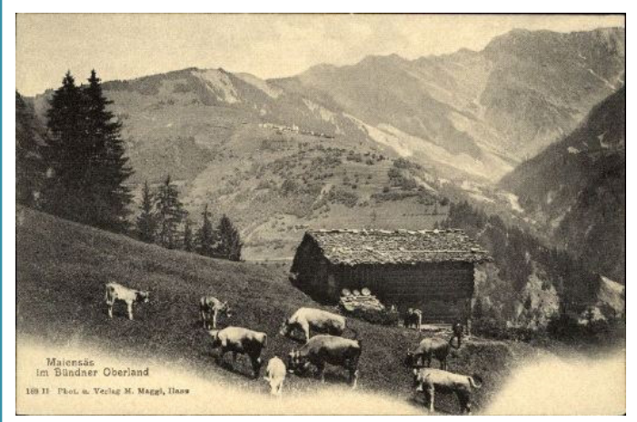
The Original Radio Hut

The book "The Key Messenger" is not a history book, but it does contain history; please do not use this website or the book as a history reference. The book contains many technical facts and technical descriptions of radio communications equipment used by the radio station operators. These descriptions are not always in the public domain, or even in the archives of governments.