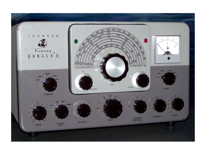
Johnson Viking Ranger II

3615 is the frequency. Wednesday afternoon from around 18:00, Saturday morning from around 05:45. Come up and join us.