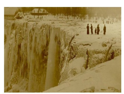
THIS PICTURE WAS TAKEN WHEN NIAGARA FALLS WAS COMPLETELY FROZEN IN THE YEAR 1911. A VERY RARE PHOTO.

No definite date has been set for the AWA annual gathering, but we will more than likely use the same venue again, Rand Airport, and it will more than likely be in April again. This just so you can start to prepare yourself